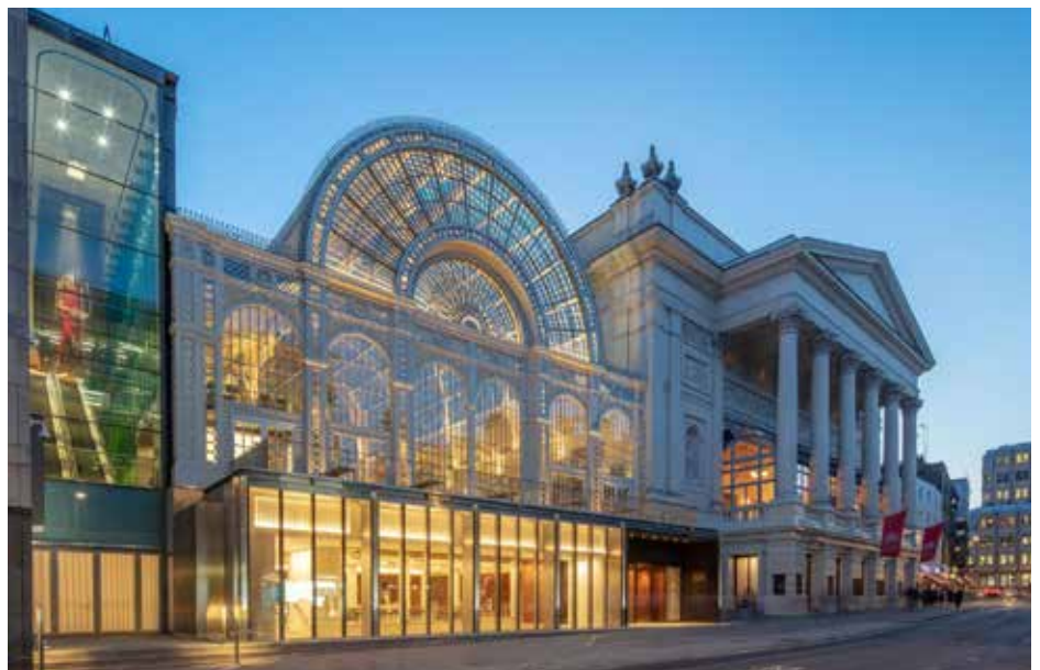
Royal Opera House, Covent Garden

Covent Garden's Royal Opera House has unveiled a transformative £51m renovation of its public areas, and is inviting all to attend an extensive programme of free and ticketed daytime events, as for the first time the ROH is open daily to the public from 10am. As part of their 'Open Up' project, the ROH has also unveiled the intimate new Linbury Theatre. Now open to the public every day from 10am roh.org.uk/about/open-up