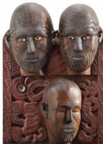
Tene Waitere, Tā Moko panel, 1896-99.

Oceania, Royal Academy of Arts, London Until 10 Dec 2018 royalacademy.org.uk