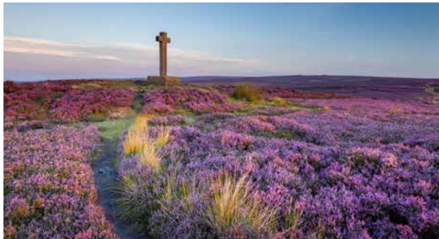
Ana Cross above Rosedale in the Land of Iron