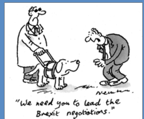
Blind © Nick Newman