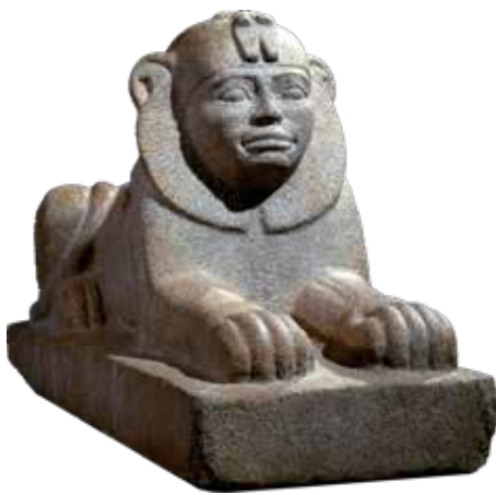
Sphinx, British Museum