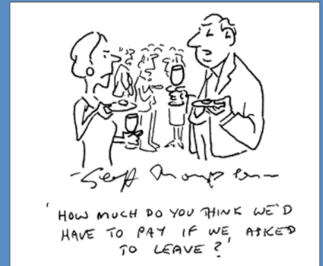
Pay to Leave

Not for many years has an issue caused such consternation as Brexit. And like all periods of upset, the issue has created a golden age for political cartoonists. The Penguin Book of Brexit Cartoons is a compilation of the best of these cartoons, perfectly capturing this unique period of bafflement in our history – whichever side of the debate you stand on.