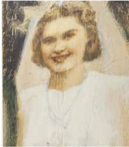
Warbrides portrait, RAF Museum, London

RAF Museum, London 4 Oct 2018 - 15 Sep 2019 rafmuseum.org.uk